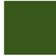
Dark Value color 2 (1/2mt)