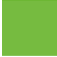
Medium Value color 4 (1/2mt)