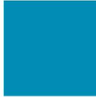
Medium Value color 5 (1/2mt)