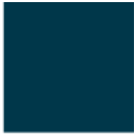
Dark fabric as sky (1mt)