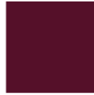
Dark Value color 1 (1/2mt)