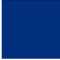
Dark Value color 3 (1/2mt)