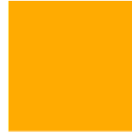
Medium Value color 6 (1/2mt)