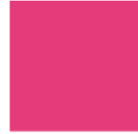
Medium Value color 7 (1/2mt)