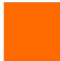
Color 16 (1 FQ)