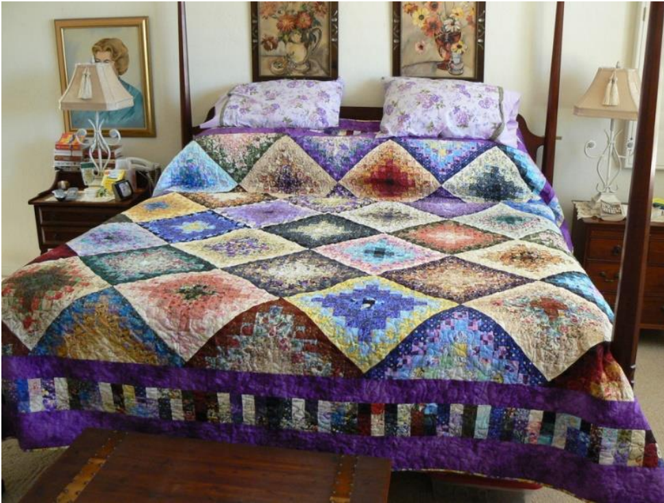
Figure 5 Student Quilt, King Size, 16 sets