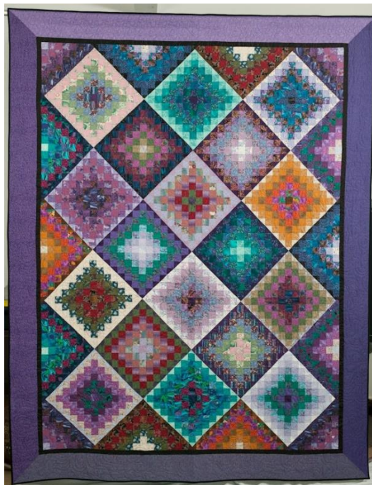
Figure 2 Queen Size, 12 sets, Purple Plus!