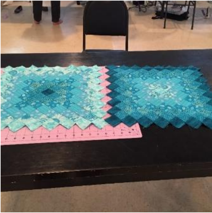
Figure 8 Monochromatic--light to dark turquoise