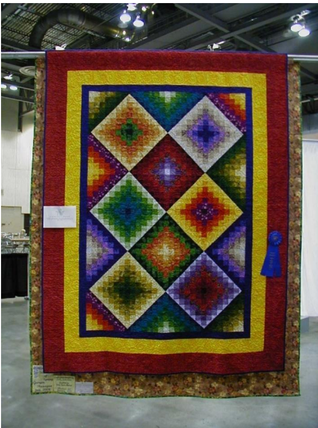
Figure 6 Student Quilt, Twin Size, 6 sets