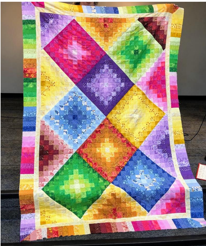
Figure 4 Student Quilt, twin size, 6 sets, fabrics kept in color families