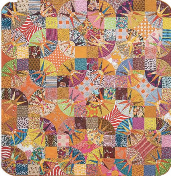
Bright Lights, Big City