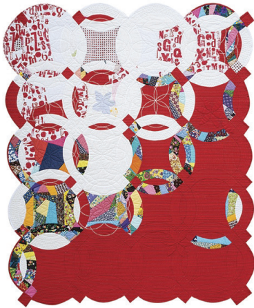
Greatest Possible Trust

Victoria Findlay Wolfe™ Quilts Fresh. Modern. Timeless.